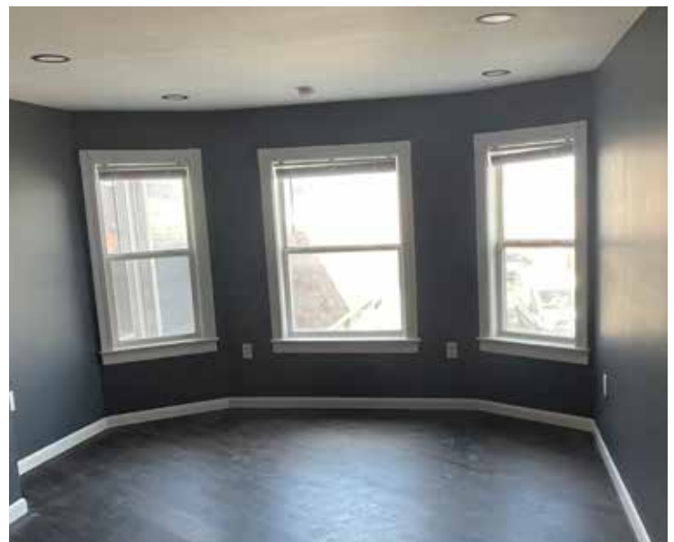
The interior living room of a new Dyer property before and after remodeling.