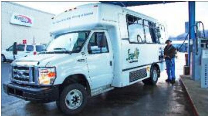
A STEP transportation van fuels up at the River Valley Transit fueling station as part of a regional transportation partnership.