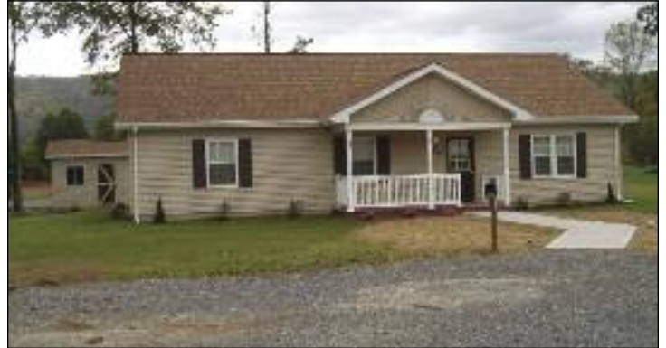
2801 Linn Street prepares for first-ever home addition project for Greater Lycoming Habitat for Humanity.

Habitat is looking forward to other scheduled projects in the near future. Groundbreaking for a home on Diamond Street in Newberry will begin immediately after the Linn Street addition is complete. Additional Habitat projects will be starting this summer through a new program, A Brush with Kindness that will offer qualified homeowners help with exterior maintenance. If you are a homeowner in need of help with yard clean-up, landscaping or minor repairs,