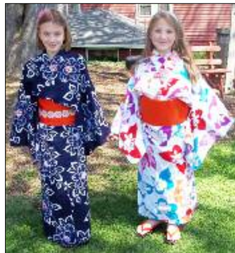
West Branch School students try on traditional Japanese clothing.