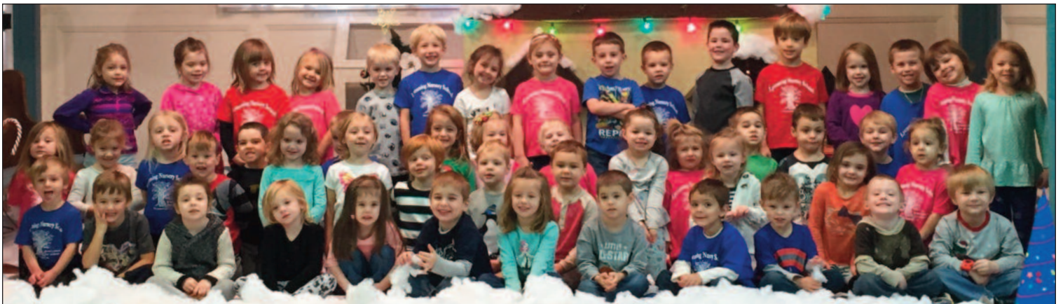
Lycoming Nursery School students