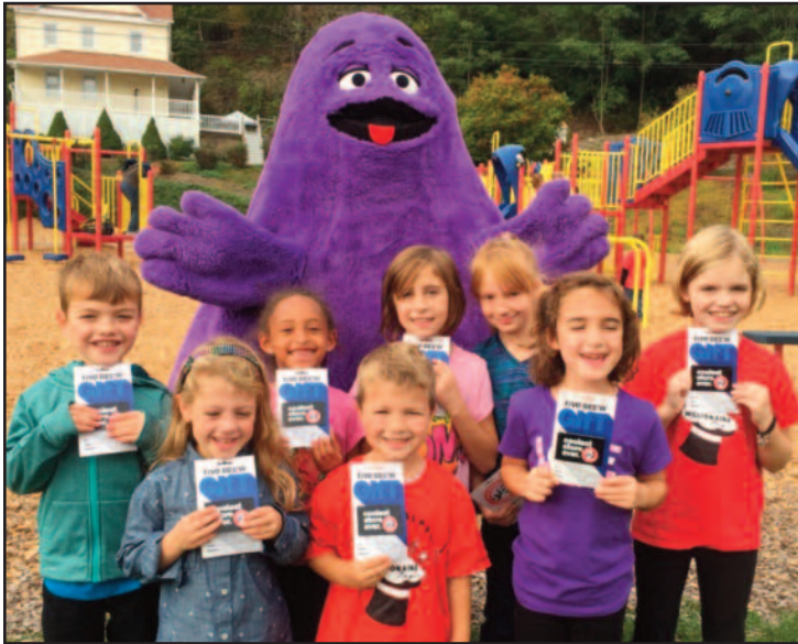
Grimace poses with Jackson Primary School students who raised the most funds for the Ronald McDonald House.