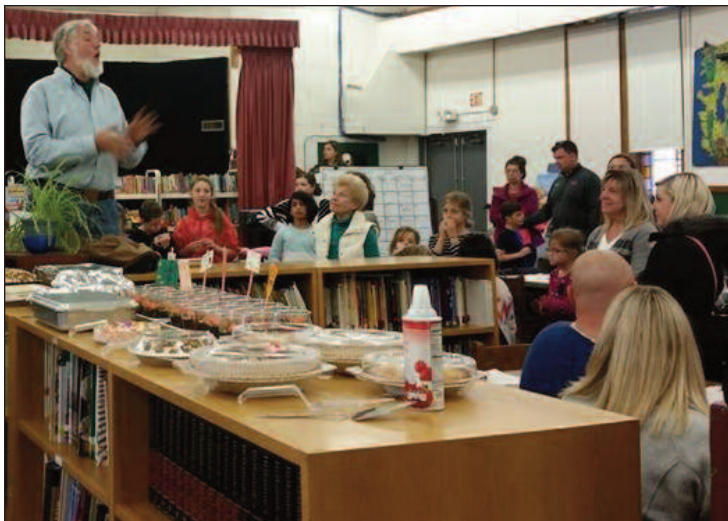
The West Branch School community gathers together to celebrate Feast Day 2016

tradition that brings the West Branch School community together to celebrate a spirit of thankfulness.