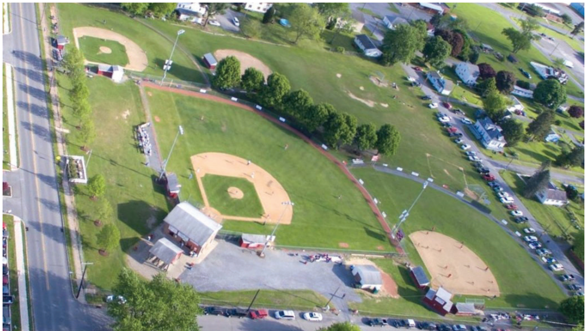
Aerial View of the Newberry Little League Complex

State Farm® Providing Insurance and Financial Services Home Office, Bloomington, Illinois 61710