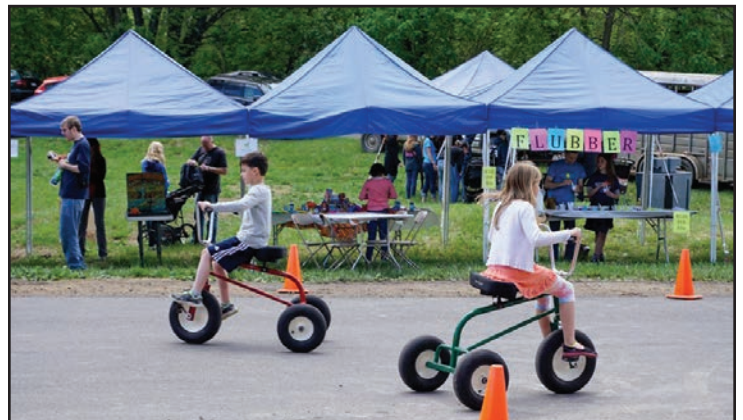
Enjoying one of the many activities in the children's section at West Branch School's annual Fair and Music Festival

West Branch School's Fair and Music Festival is sure to be a fun time and an enjoyable way to spend a few hours on Saturday, May 13. There is no cost to enter the fair, and food, tickets, and craft items may be purchased separately. For more information, please visit www.westbranchschool.org or call 570-323-5498.